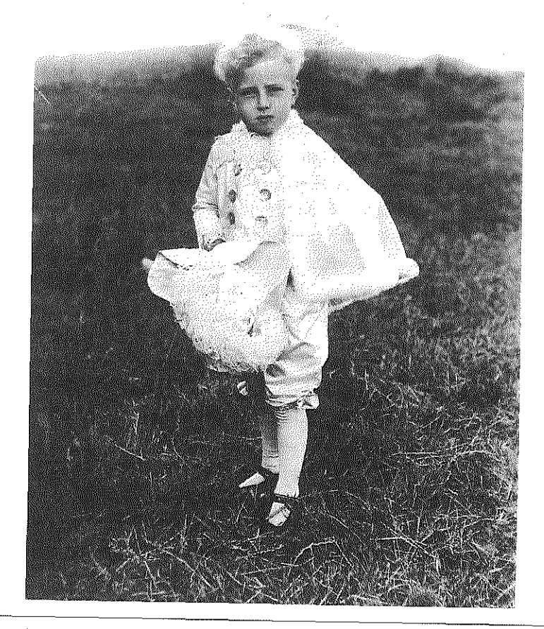
1.4 The Queen's Page. From W. G. Sebald, Austerlitz, translated by Anthea Bell (New York: Modern Library, 2001)

In Austerlitz, the performative index structures every one of the photographs included, and even the very identity of the protagonist. Named after its main character, the novel's cover displays a photograph that is later revealed to be of that character as a child (figure 1.4). As we read, we have to ask ourselves, who is the curly-haired blond boy on the cover