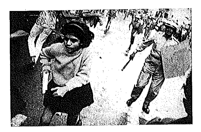
44 Repression of a Black Panthers' demonstration, Jerusalem (1971): Photograph by Shimshon Wigoder

ish colonialism while also practicing colonial policies toward the indigenous peoples. Finally, I would argue for a triangular structural analogy by which the Palestinians represent the aboriginal "Indians" of Euro-Israeli discourse, while the Sephardim or Mizrahim, as imported cheap labor, constitute the "blacks" of Israel.28 (Taking their name from the American movement, the Israeli "Black Panthers," for example, sabotaged the myth of the melting pot by showing that there was in Israel not one but two Jewish communities—one white, one black; figure 44.) The manifest Palestinian refusal to play the assigned role of the presumably doomed "Indians" of the transplanted (far) Western narrative has testified to an alternative. The story of the Jewish victims of Zionism also remains to be heard.<sup>29</sup>