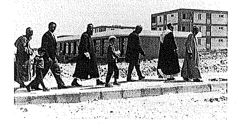
42 The path to modernization: Yeminis on the way to the Joint Transitional Camp, Aden, 1949 (top); Moroccans entering housing project in Mitzpe Ramon, Israel, 1964 (bottom)