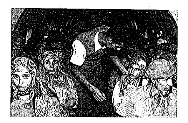
41 Yemeni Jews arriving in the "Promised Land" (1949)

The selective readings of Middle Eastern history, in other words, make two processes apparent: the rejection of an Arab and Muslim context for Jewish institutions, identity, and history, and their unproblematized subordination into a "universal" Jewish experience. In the Zionist "proof" of a