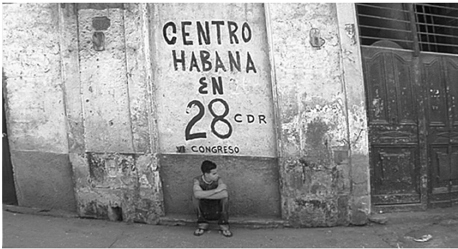
Figure 1.2. Painted sign near my apartment in Central Habana.