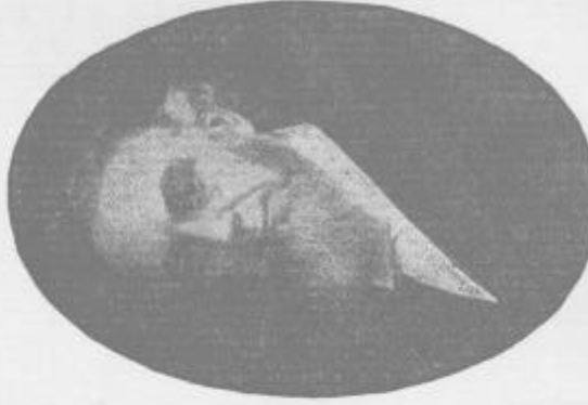
CHAS. T. RUSSELL