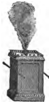
THE "GOLDEN ALTAR."

Opposite the "Table of Shew-bread" stood the "Candlestick," made of pure gold, beaten work (hammered