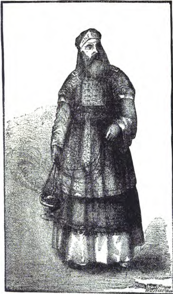
THE HIGH PRIEST IN ROBES TYPICAL OF CHRIST'S COMING GLORY.