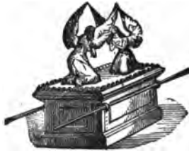
THE ARK OF THE TESTIMONY.

Further on, close up to the "Vail," stood a small altar, of wood covered with gold, called the "Golden Altar" or "Incense Altar." It had no fire upon it except when the priests brought it in the censers which they set in the top of this "Golden Altar," and then crumbled the incense upon it, causing it to give forth a fragrant smoke or perfume, which filling the "Holy" penetrated also beyond the "second vail" into the Most Holy or Holy of Holies.