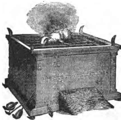
THE BRAZEN ALTAR.

It will be noticed that the three entrance passages, viz. , the "Gate" into the "Court," the "Door," into the "Holy," and the "Vail" into the "Most Holy," were of the same material and colors. Outside the Tabernacle and its "Court" was the "Camp" of Israel surrounding it on all sides at a respectful distance.