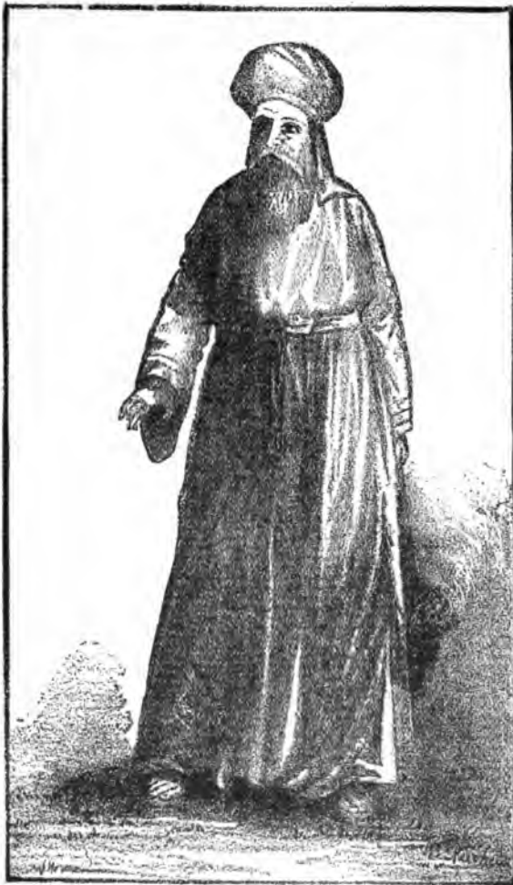
A PRIEST—IN LINEN GARMENTS.