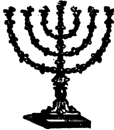
THE GOLDEN CANDLESTICK.

Within the Tabernacle, in the first apartment, the "Holy," on the right (north), stood the Table of "Shew-bread"—a wooden table overlaid with gold; and upon it were placed twelve cakes of unleavened bread in two piles, with frankincense on top of each [pile. (Lev. 24:6, 7.)