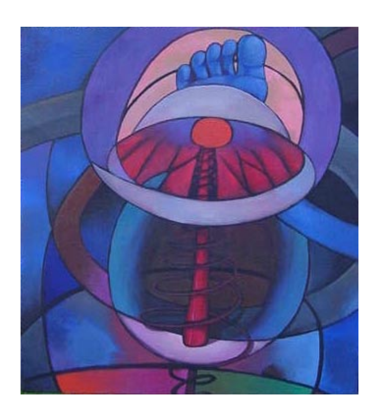
THE UNIVERSE BENEATH NUKVA'S FOOT © Don Karr 1986, oil on canvas

BD §§ I, II, and III were included in the 1994-5 edition of The Kabbalah of Maat , along with a three-page "Commentary on the Book of Deviations ," which had been compiled in 1993. Some additions from this commentary appear in the text {in brackets}.