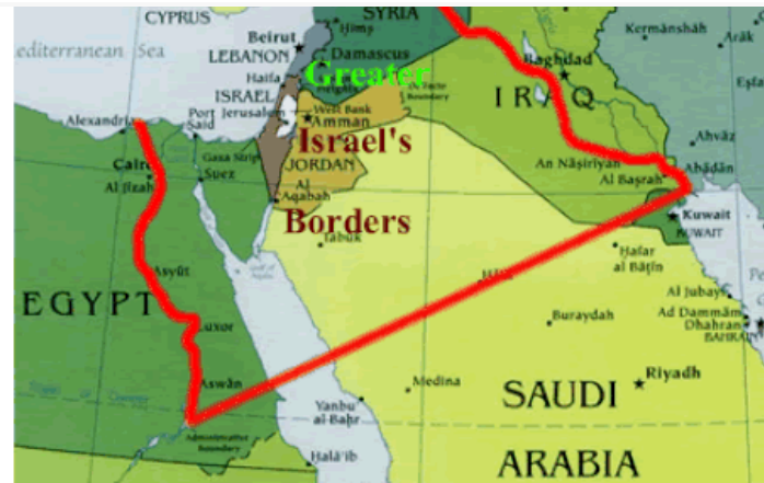
ERETZ ISRAEL (the Zionist plan for a greater "Israel")

It seems that Esau, masquerading under the name of Jew, is proving to be intolerable to the Jews themselves. The Book of Revelation long ago exposed this false element, describing them as "them of the synagogue of Satan, which say they are Jews, and are not, but do lie" (Revelation iii, 9).