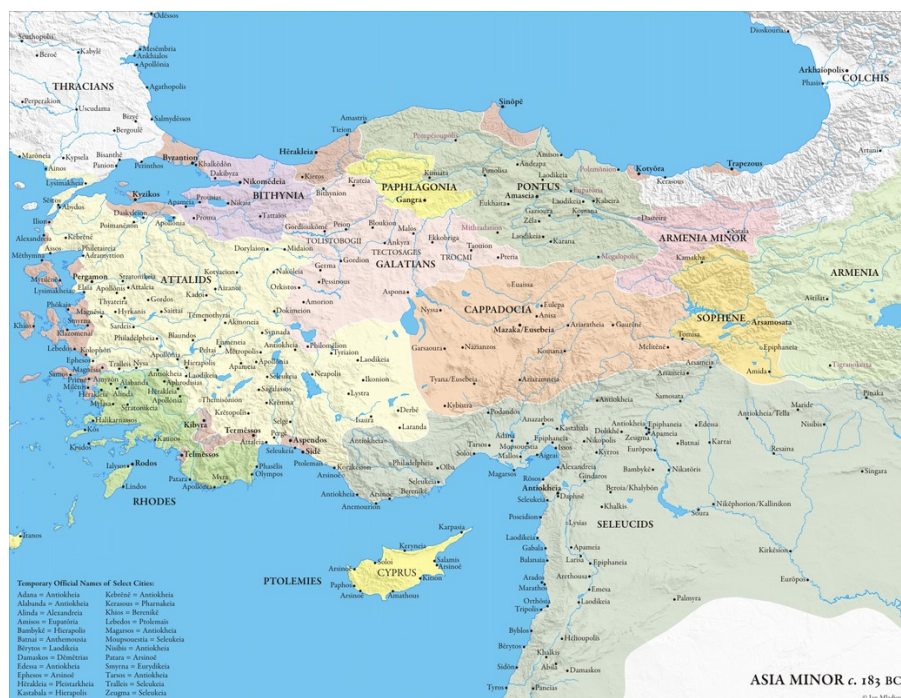
Map showing Anatolia (Turkey) and Armenia

Further, multitudes of the Jewish nation accepted Christianity in our Lord's day, and, as happened to the Apostles themselves, were rejected by the nation: their descendants became joined to the Christian church in different countries, and even to the British people, their kinsmen of Israel, who seized the Gospel with avidity , becoming Abraham's seed in faith also, and full heirs to the Promised Land.