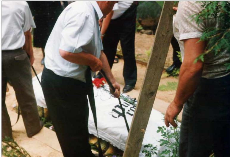
Photo 7. Covering the coffin with a special linen brought from a tradition agency. Relatives lowering the coffin to the grave. Photo by Marju Kõivupuu, 2001.