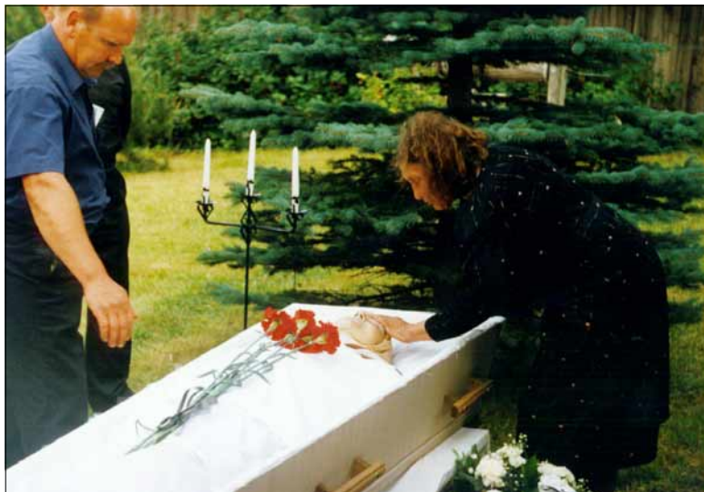
Photo 2. The rite of sending off from home. Hargla parish. Sister saying goodbye to the deceased. Photo by Marju Kõivupuu, 2001