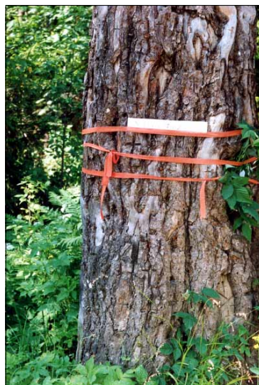
Photo 12 (left). Cross pine in Hargla parish.