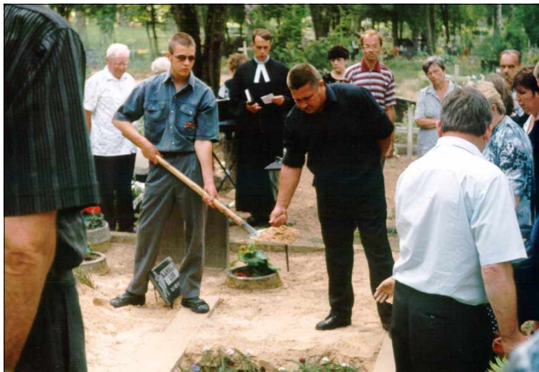
Photo 8. The ritual throwing of three handfuls of soil into the grave. Photo by Marju Kõivupuu, 2001.