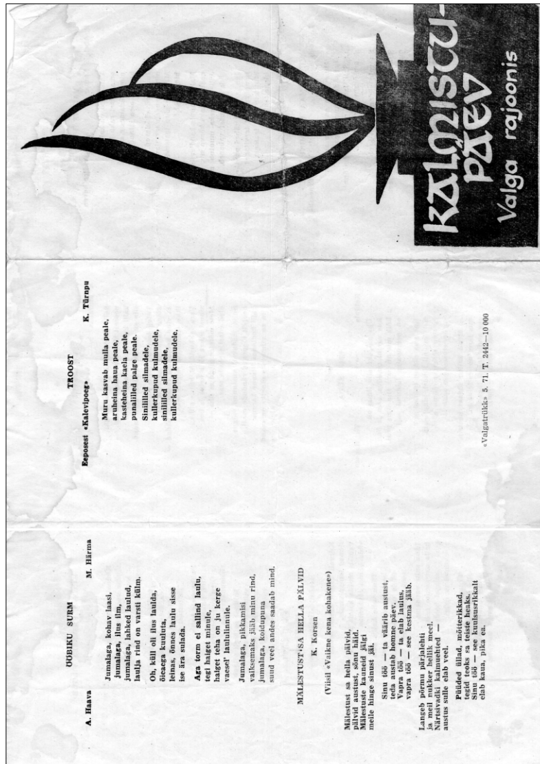
Photo 11. A song leaflet from the 1970s Soviet secular cemetery day.