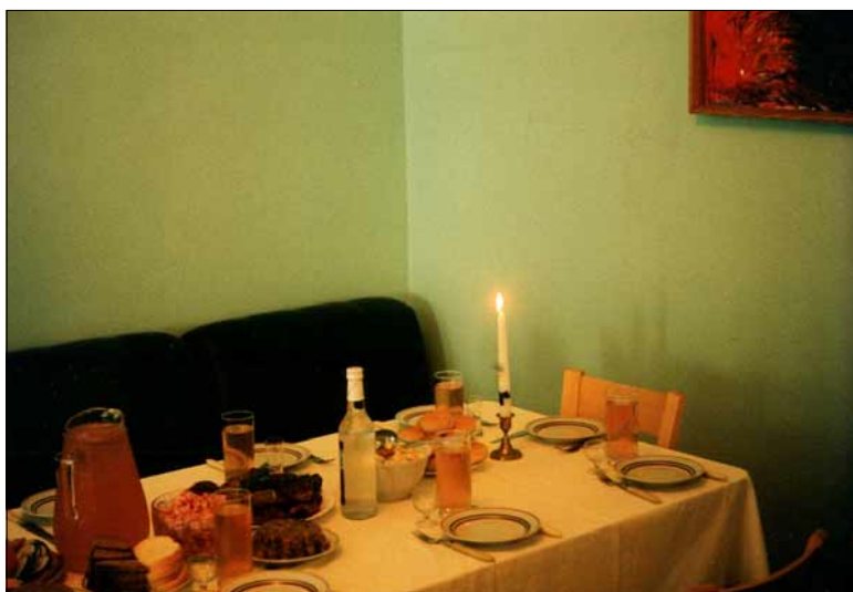
Photo 10. Mourning feast table. The place at the head of the table is symbolically set for the deceased. To mark this and for commemoration, a mourning candle has been lit. Photo by Marju Kõivupuu, 2001.