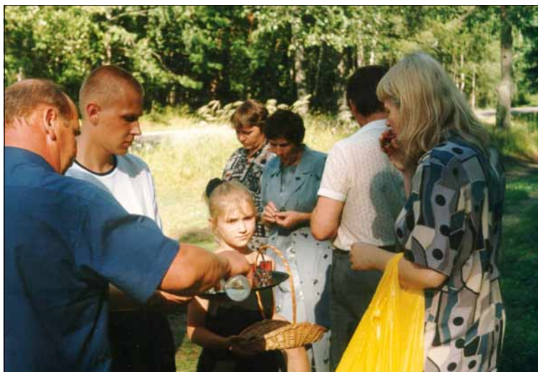
Photo 9. Ritual offering of alcohol and snacks at the cemetery gate after the burial.