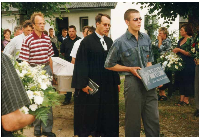
Photo 3. The rite of sending off from home. Hargla parish. Carrying the coffin to the car.