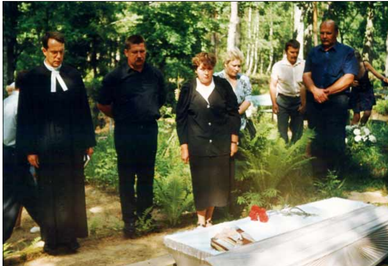
Photo 5. Saying goodbye at the cemetery by the open coffin. Photo by Marju Kõivupuu, 2001.