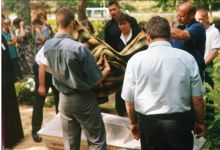
Photo 6. Saying goodbye at the cemetery. Covering the coffin with a home-made woollen blanket. Photo by Marju Kõivupuu, 2001.