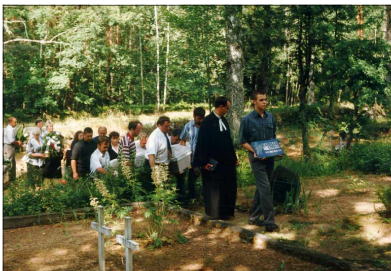
Photo 4. Mourning procession at the cemetery. Photo by Marju Kõivupuu, 2001.