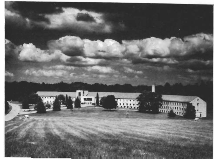
The main building of the national headquarters. Honesdale, Pa.

Yoga-nidrā Yogic sleep. It is an evolved technique of going to the deep sleep voluntarily and being fully aware of the environment at the same time.