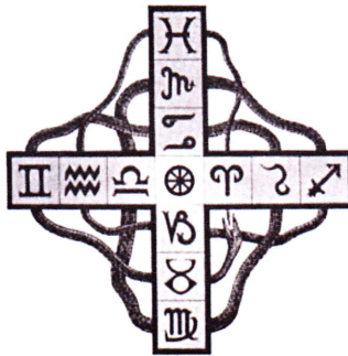
The Greek Cross of the Zodiac

(Thus is the Great Pyramid duly sealed.)