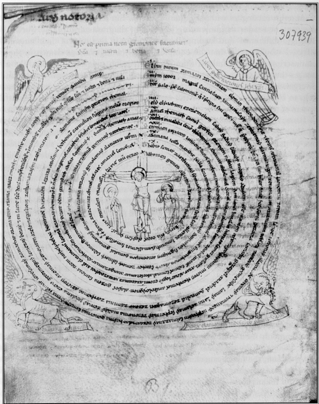
The First Note of Grammar