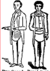
Due Guard. Penal Sign. Master Mason.