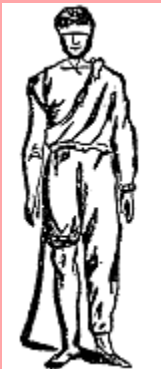
Dress of Fellow Craft.

The Holy Bible ought to be opened at the 7th chapter of Amos and one point of the compass elevated above the square.