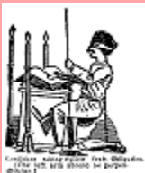
Complete Masonic Dress (Fell. Degree) — The left arm should be perpendicular to the right.

Worshipful Master to Candidate:—"You will advance to the altar, kneel upon your naked right knee, your left forming a square, your right hand resting on the Holy Bible, square and compass, your left forming a right angle supported by the square in which due form you will say, "I," with your name in full, and repeat after me.