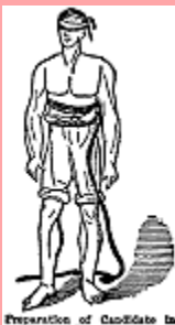
Preparation of Candidate in Master Mason's Degree.

PASS OF FELLOW CRAFT —Shibboleth. It is the name of this grip.