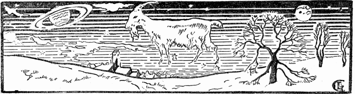
A Character Delineation of the Children Born between December 22nd, 1924, and January 20th, 1925, inclusive.

The children born while the sun is passing through the Saturnian sign of Capricorn are of a serious, persistent, ambitious, and persevering nature. At times, however, they have spells of gloom and melancholy when it is most difficult for any of their home people to help them. They are very suspicious and very argumentative. They will persist in their arguments until with their dominant will they have often convinced their parents or guardians. They possess a martial nature, for Mars, the aggressive planet, is exalted in this sign. They have strong ambition for power, as Capricorn is the natural tenth house sign and the tenth house denotes those in authority—leaders, generals, etc. This tendency is expressed in the Capricorn children.