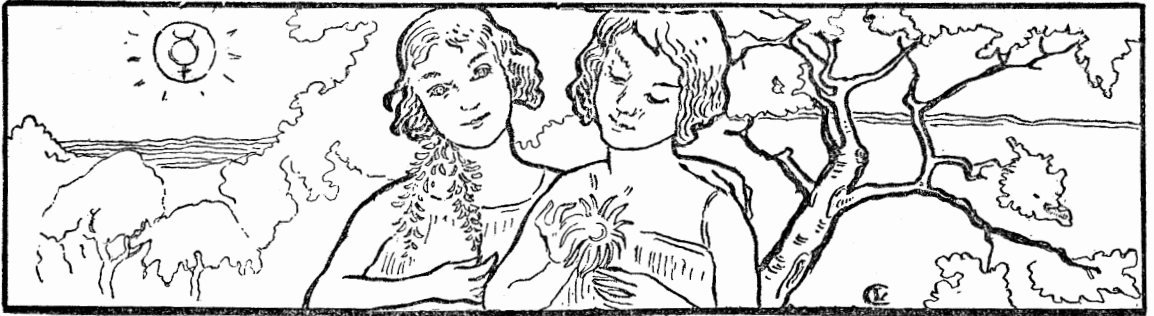
A Character Delineation of the Children Born between May 22nd and June 21st, inclusive, 1926.

The children of Gemini are usually of two types. The symbol of this sign is the Twins, and truly Gemini expresses itself through two personalities, two types. We have the strong intellectual type, that of the ingenious inventor giving out new ideas; also the person fond of literature and science. Then we have the negative, vacillating type which is lacking in strength of will. The man of this type expresses his negativeness even in his walk, with shoulders drooping, chest in, and feet dragging. He also sits with back humped. This type is ever dependent upon others to instill in him the energy to do something to keep from starving. The average Gemini person, however, expresses a part of both of these personalities. He is easily influenced by others.