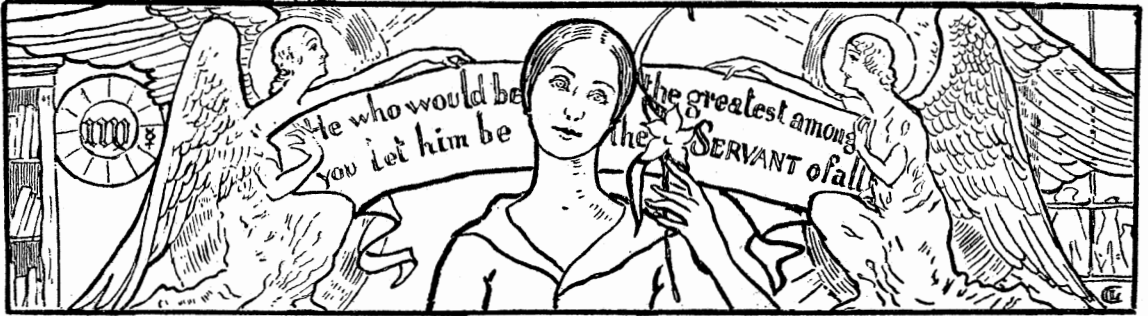
A Character Delineation of the Children Born between August 24th and September 23rd, inclusive, 1926.

The natural ruler of Virgo is the intellectual planet Mercury. The nature of this planet is expressed through the sign of Virgo, giving the native a literary and scientific also nervous nature. The Virgo usually is endowed with a good intellect. These people are given to detail; in fact, they often take every opportunity to find the tiniest flaws in things. They themselves as a rule are most careful and accurate in whatever they do, but they are apt to doubt the ability of others. This is the reason why we find that the Virgo often gets loaded up with many duties. He attracts them on account of his love of detail. It takes him longer to do his work than the average person, but when it is finished it is well done. The Virgo makes a better server than an employer for the reason that he often lacks confidence in his employees' ability to do things as well as he can, and he is prone to do work over, thereby losing the respect and the good will of his workers.