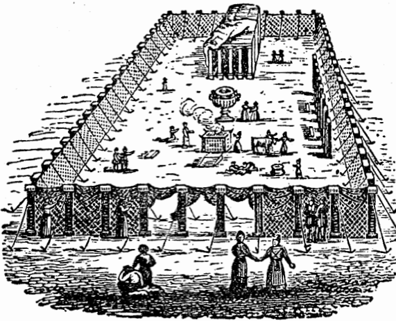
The Tabernacle in the Wilderness

sources in this quest, for our Father in Heaven has Himself prepared a way marked with guide posts which will lead us to Him if we follow. But as we have forgotten the divine Word and would be unable now to comprehend its meaning, the Father speaks to us in the language of symbolism, which both hides and reveals the spiritual truths we must understand before we can come to Him. Just as we give to our children picture books which reveal to their nascent minds intellectual concepts which they could not otherwise understand, so also each God-given symbol has a deep meaning which could not be learned without that symbol.