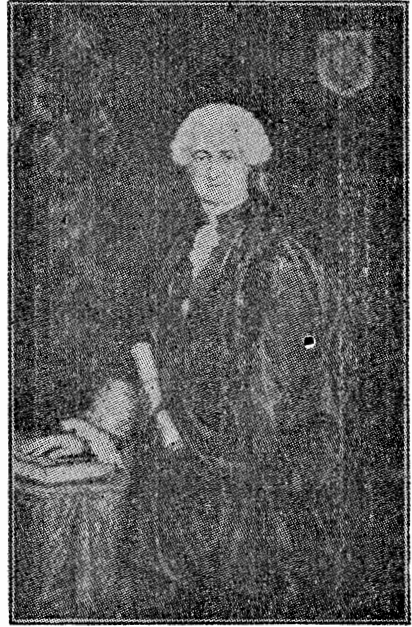
COMTE DE ST. GERMAIN

by a magnificently sculptured statue of Christ Jesus. He remarked: "I am astonished at the similarity of this Christ with the original one whom I have known very well." He then proceeded to tell the whole story of Christ. He was then asked if he meant it seriously. "Oh, yes, very seriously," was the reply. He is said to have related the story so convincingly that the listeners lived the action and imagined themselves to