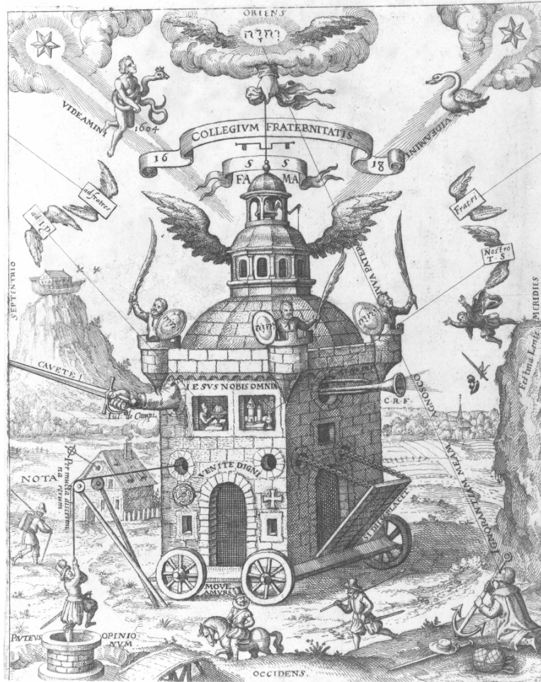
108. The Collegium Fraternitatis, from Speculum , Th. Schweighardt, 1618.