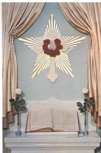
110. The Rosicrucian Emblem.

“When inquiring into the meaning of any myth, legend or symbol of occult value, it is an absolute necessity that we should understand that, as any object in the three-dimensional world may, or rather must, be viewed from all points to obtain a full and complete comprehension thereof, so all symbols have a number of aspects. Each viewpoint reveals a different phase from the others, and all have an equal claim to consideration.