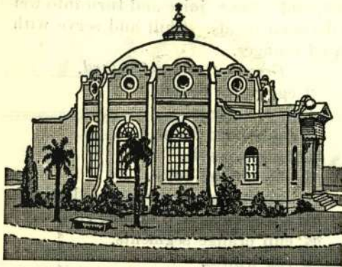
ROSICRUCIAN TEMPLE OF HEALING