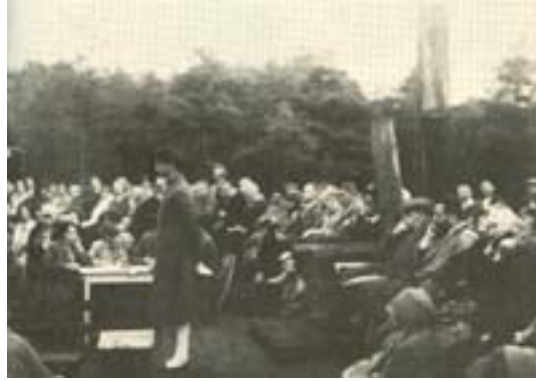
Krishnamurti speaking in Ommen

I AM going to answer all these questions from my point of view, and I am not basing my answers on any authority whatsoever. I know that you would all like my answers to be based on authority, but I am afraid you will be disappointed. I am not urging you to accept that which I hold to be the absolute Truth, but I am leaving it to your own judgment, which alone is valuable, which alone is lasting and which alone should guide, uphold and protect you. So with this in mind we will proceed, and please have patience, and listen diligently, because I know that if you do not understand wisely, you will ask these same questions again next year.