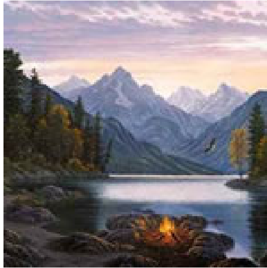
Talks in Eerde Castle, Holland, 1927