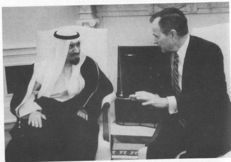
Former U.S. President Bush and Emir Al-Sabah.