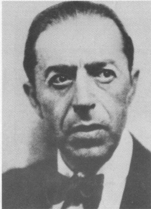
Sydney Reilly-economic specialist MI6.