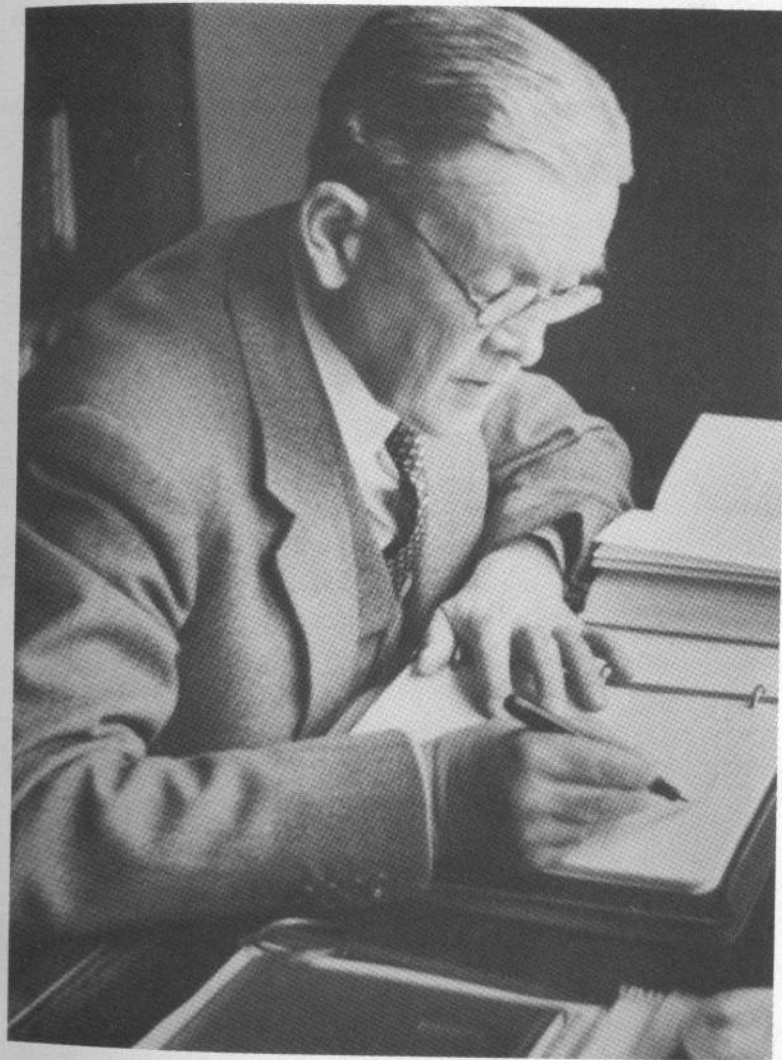
Bruce Lockhart-MI6 controller of Lenin and Trotsky.