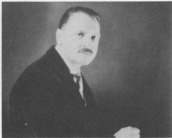
Somerset Maugham-MI6 special agent to Kerensky.