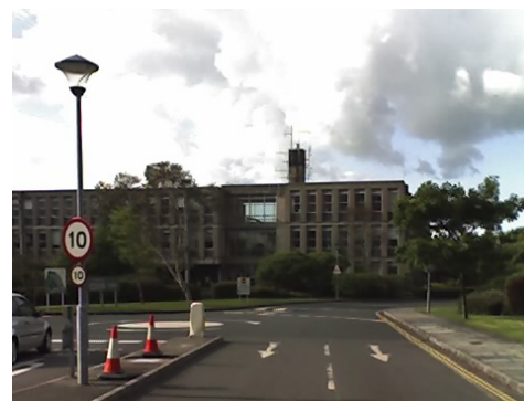
Cornwall's Corrupt County Council