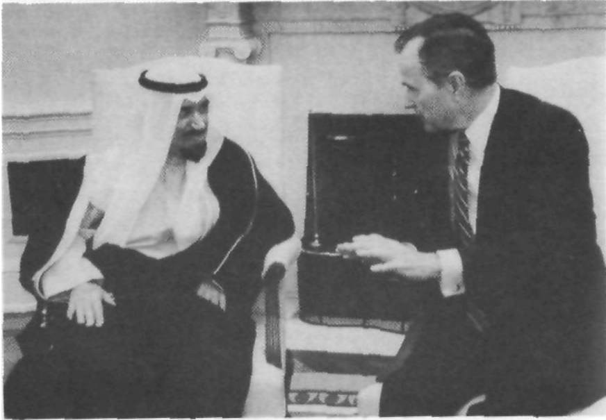
Former U.S. President Bush and Emir Al-Sabah.