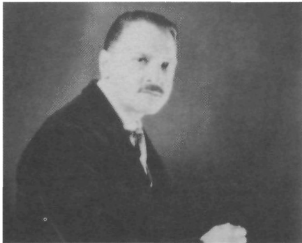
Somerset Maugham-MI6 special agent to Kerensky.