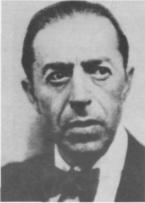
Sydney Reilly-economic specialist MI6.