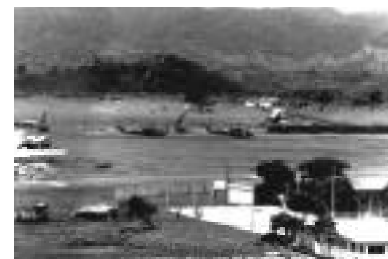
Ilopango Airbase, El Salvador, where drugs and guns came and went, with the help of the Contra-supporting CIA and NSC.