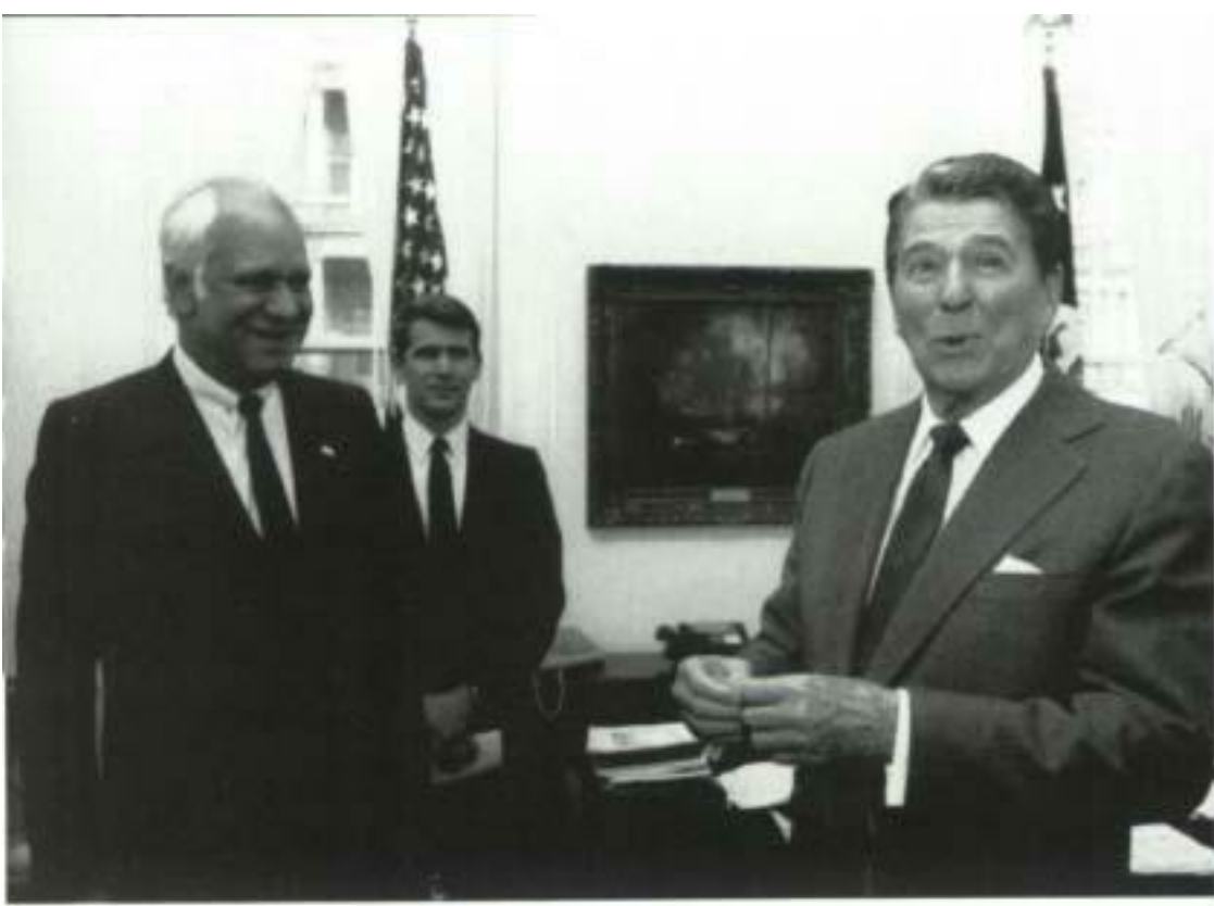
The Oval Office, April 4, 1985. From left: CIA agent Adolfo Calero, political boss of the FDN; Lt. Col. Oliver North and President Ronald Reagan, after the CIA handed off the day-to-day management of the Contra project to North and the National Security Council.