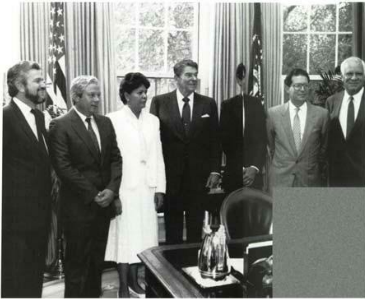
The Oval Office, August 5, 1987. A gathering of Nicaraguan resistance leaders to mark yet another CIA-inspired merger of the Contra armies from the FDN to the United Nicaraguan Opposition (UNO). Second from left is Aristides Sanchez. Adolfo Calero is on the far right.