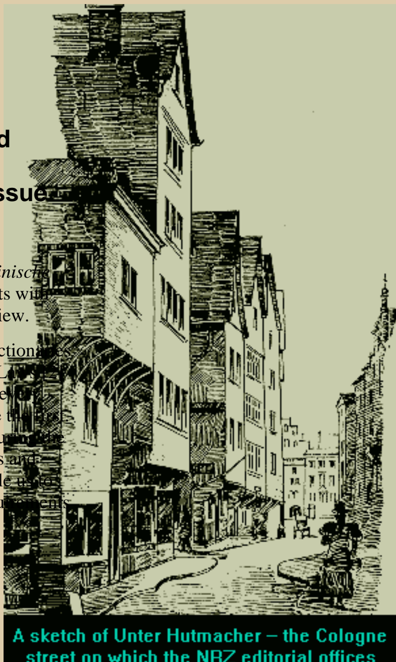
A sketch of Unter Hutmacher – the Cologne street on which the NRZ editorial offices