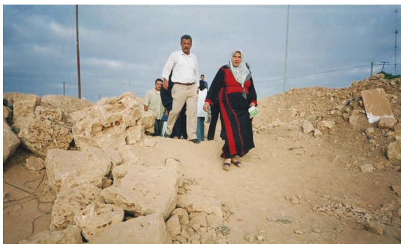
2 Blockaded village, West Bank, 2003