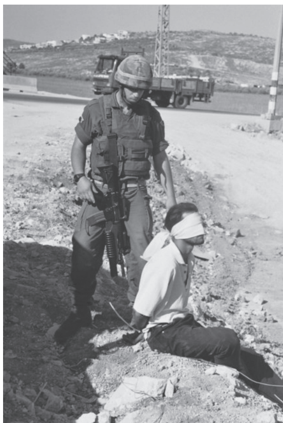
7 Huwarra checkpoint, 2004

decision-making process and creating a firmer ideological platform. This will give clear guidelines for CPW's mission and conduct at the checkpoints. It is to be hoped that this platform will be broad enough to accommodate a wide spectrum of ideological commitment, yet without compromising the political message that underlies its humanitarian activism.