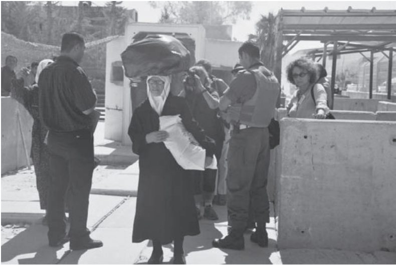
1 Beth Iba checkpoint, 2004

ness, visit family. The process of acquisition is equally long, arbitrary and uncertain. Furthermore, permits are issued for different, often very short, periods of time and cease to be valid whenever there is a closure of the West Bank cities and villages, as in October 2003 when, as a collective punishment for a suicide bombing in a Haifa restaurant, all three-month permits were declared invalid and Palestinians were ordered to take out permits with a date of issue after 7 October (see Appendix 2). In such cases, the whole application process must be repeated, with no guarantee of success. In order to acquire a work permit in Israel, the applicant's employer must also submit a request on his/her behalf.