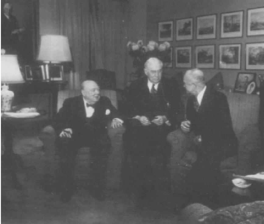
All his life Churchill followed U.S. financier Bernard Baruch's advice. In February 1938 it nearly bankrupted him; Churchill recovered his fortunes, but the empire never did.

'He means to say same thing in Commons on Tuesday.'