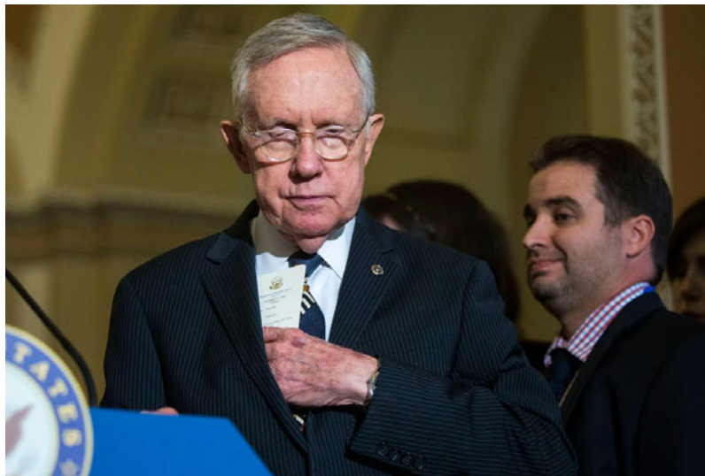
Harry Reid, the former Senate majority leader, has had a longtime interest in space phenomena.

On CBS's "60 Minutes" in May, Mr. Bigelow said he was "absolutely convinced" that aliens exist and that U.F.O.s have visited Earth.