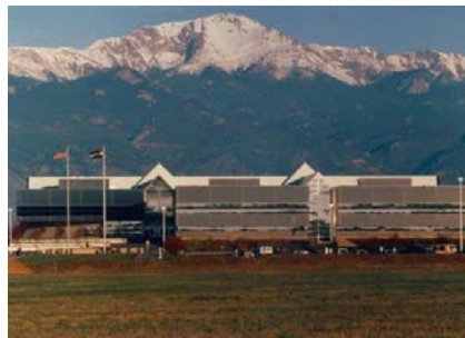
Above: External View of US Space Command at Cheyenne Mountain, Colorado.

http://www.spacecom.af.mil/usspace/cmocfb.htm