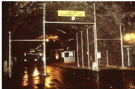
Command Control Center is below