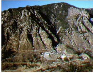
Above: Aerial View of US Space Command Facilities at Cheyenne Mountain, Colorado.