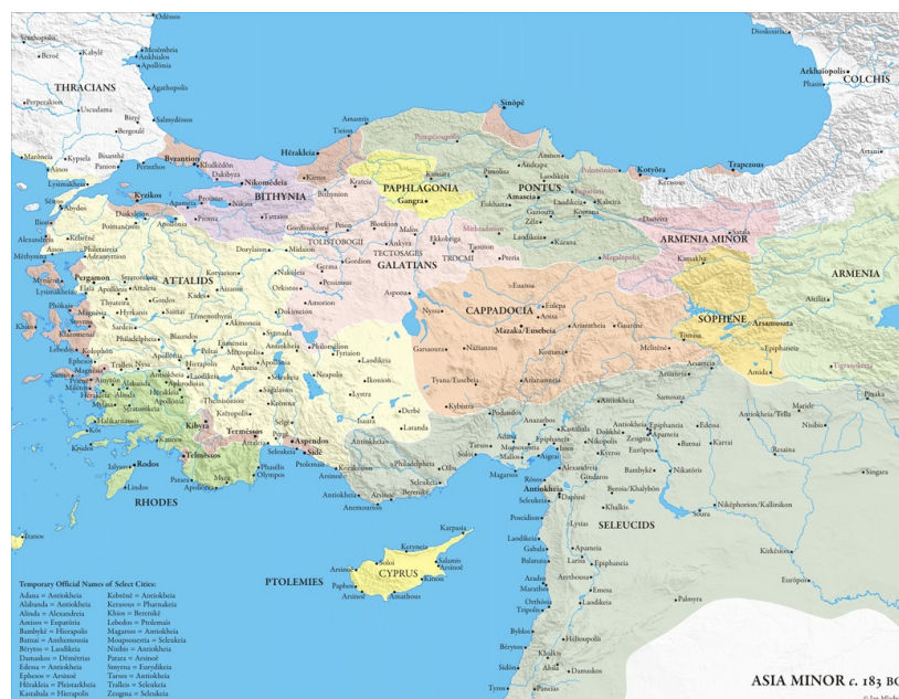
Map showing Anatolia (Turkey) and Armenia

Further, multitudes of the Jewish nation accepted Christianity in our Lord's day, and, as happened to the Apostles themselves, were rejected by the nation: their descendants became joined to the Christian church in different countries, and even to the British people, their kinsmen of Israel, who seized the Gospel with avidity , becoming Abraham's seed in faith also, and full heirs to the Promised Land.