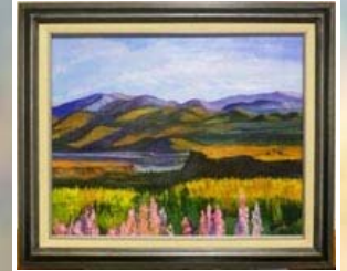
Columbia River Gorge 16x20

Critique of Jewish Pre-eminence in America World of the Jewish Mafia Egyptian-Masonic-Satanic Connection Freemasonry - Mystery Religions Crowley, 33° Mason, Human Sacrifice Egyptian Mystery - Masonic Lodge Satanic Ritual Abuse Trance Formation of America Child Sexual Abuse The End of Legends