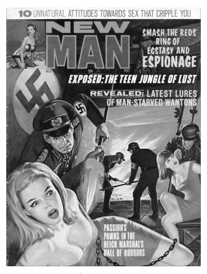
New Man, November 1965 (EmTee Publishing).

Strikingly, the women in the MAMs from the 1960s seem to have all been busy preparing for a glamorous night out when they were kidnapped, bound, and readied for torture. Wearing lacy bras and deep red lipstick, they were apparently ready for sex when captured. The New Man cover from November 1965 is typical in this: block out all of it except the faces of the victims and their expres-