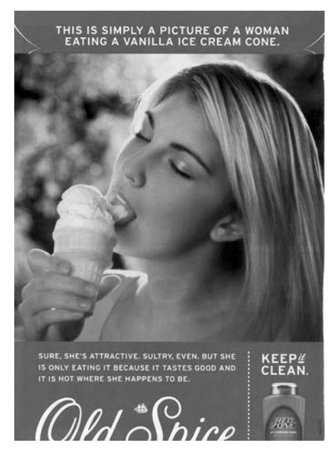
Old Spice ad.

times, including in the phrase eating it . Instead of the semen-like splash of lotion in the Clinique ad, we have semen-like melted ice cream on the young woman's tongue, from an ice-cream cone that resembles an erect penis right down to the pastry cone shaft.