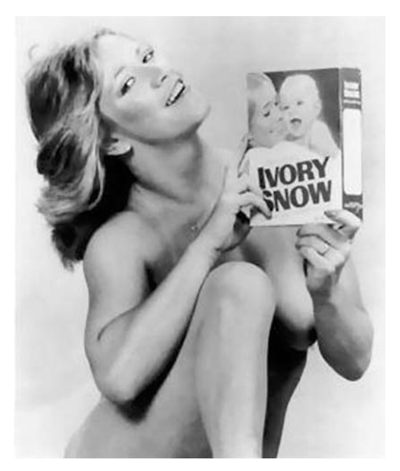
Marilyn Chambers, holding the box of Ivory Snow for which she posed as the mother.

Beginning in the early 1970s, then, it became increasingly easy to acquire porn without buying it under the counter or from a shady character on a street corner. One could simply go to the neighborhood theater or, beginning in the 1980s, to a hotel or motel with in-room pay-per-view. In the 1990s, of course, porn would come right to your home through cable offerings such as Vivid, the Spice Channel, and the Playboy Channel. In these ways, the acquisition of porn has become quick and easy, a critical step in its destigmatization.