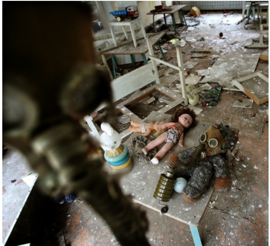
A kindergarten in the abandoned town of Pripyat, Ukraine.