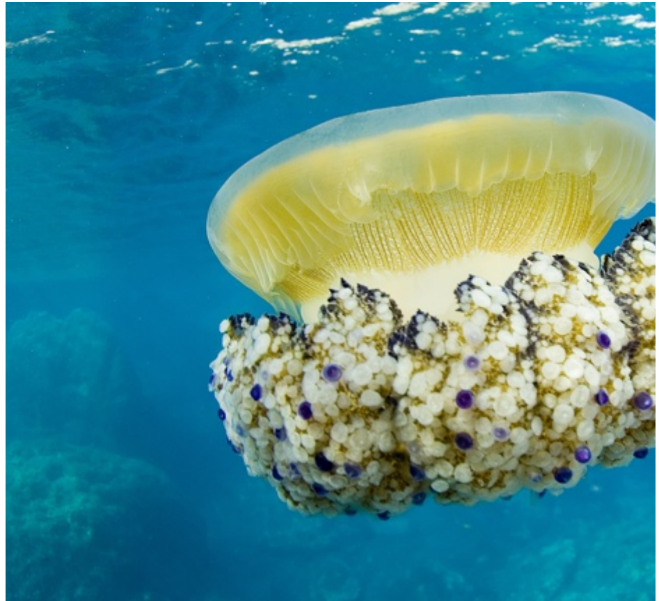
Jellyfish near Majorca, Spain.

Read about the animal species most at risk from the Gulf oil spill.