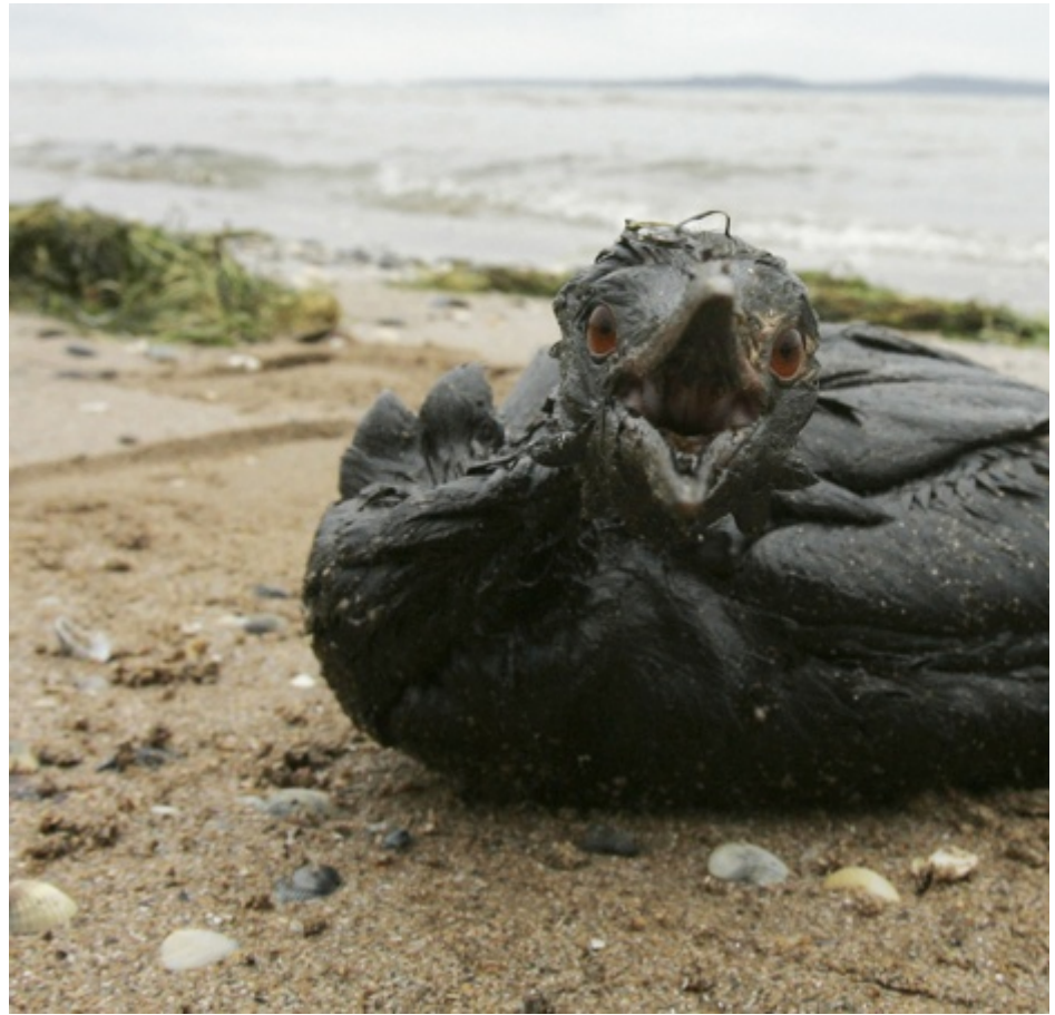
A bird stained with oil after a 2007 spill near Russia.