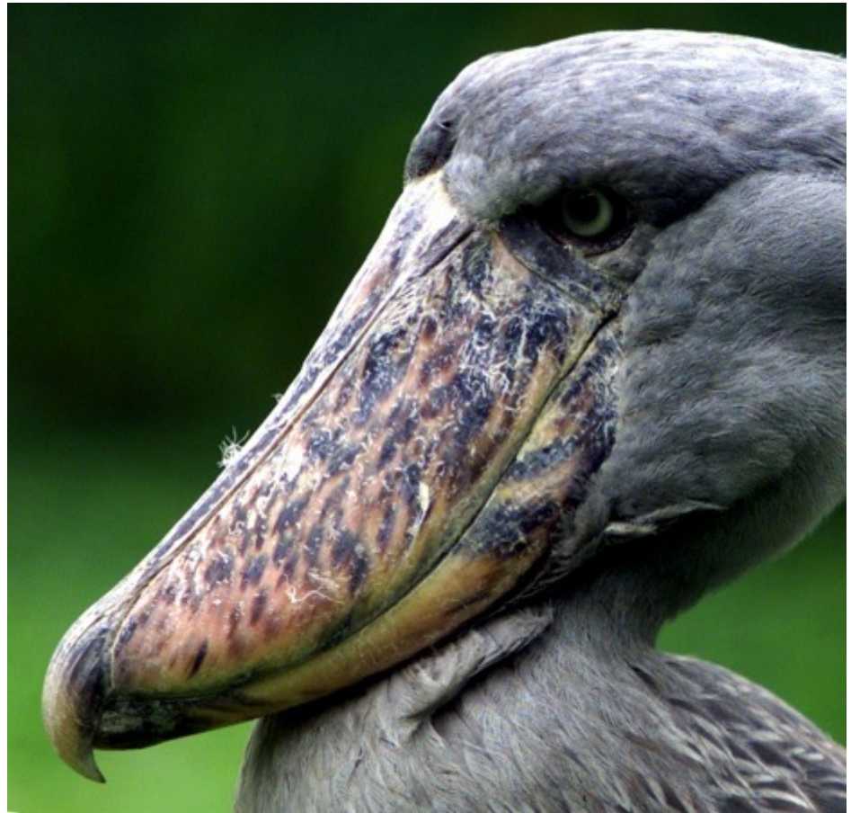
A highly endangered shoebill.