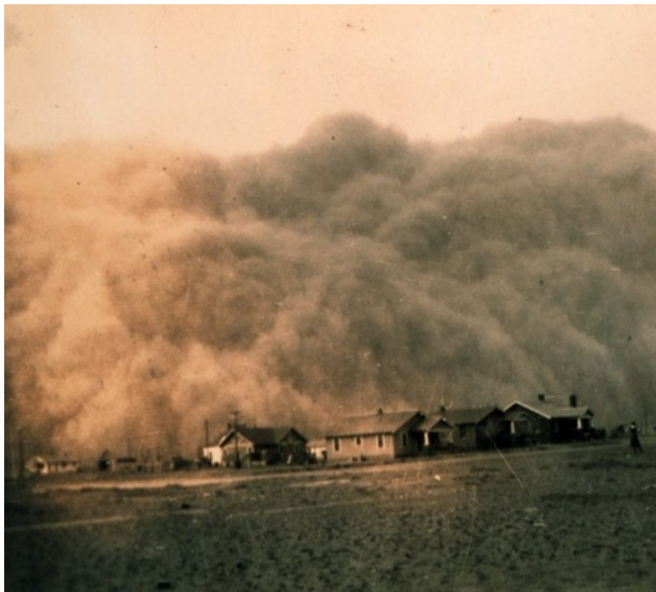
Dust bowl of 1935 in Stratford, Texas.