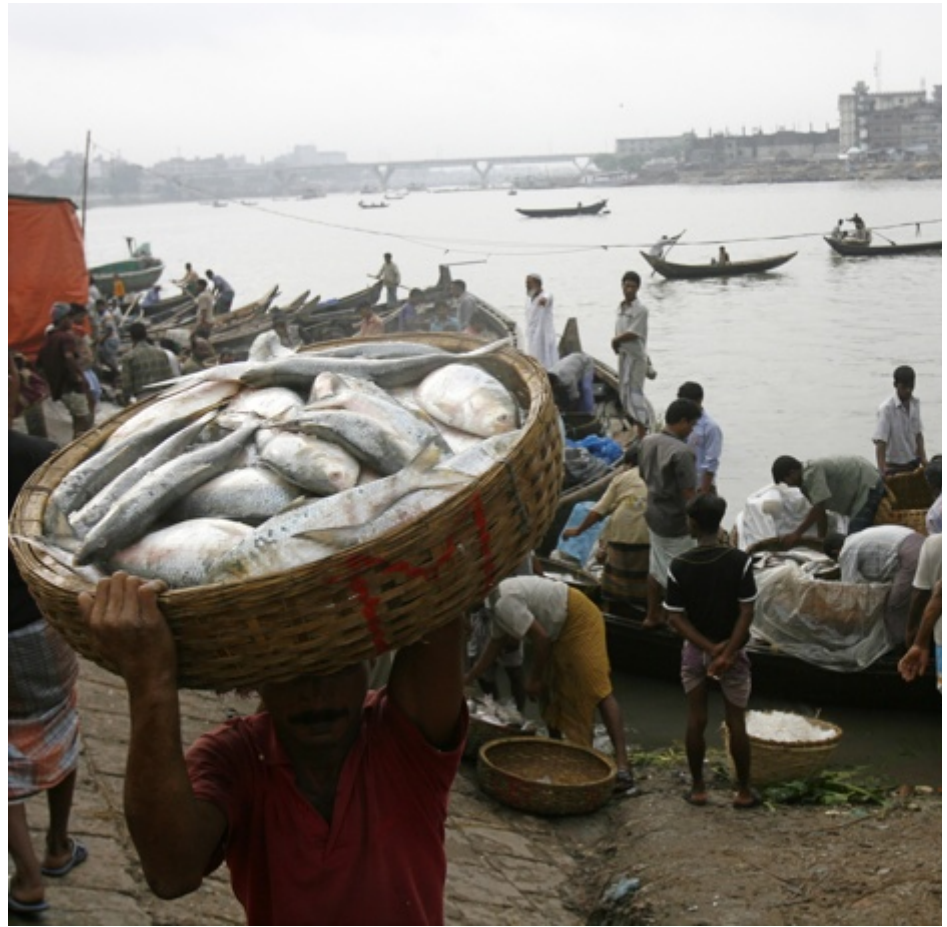
Wholesale market in Bangladesh.