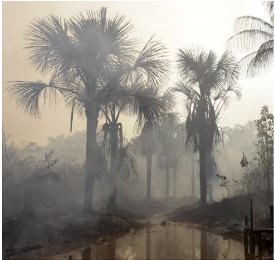
The Amazon near Mandaquiri, Brazil.