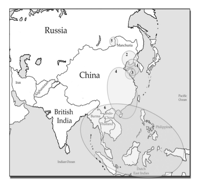
Figure 1 Geographical locations of Japan's six major conflicts in modern times (1) The First Sino-Japanese War, 1894–5 (2) The (first) Russo-Japanese War, 1904–5 (3) The First World War, 1914 (4) The Second Sino-Japanese War, 1937–45 (5) The (second) Russo-Japanese War, 1939 (6) The Pacific War, 1941–5.

and reporters attended the conflict and reported on the combat behaviour.<sup>6</sup> While they questioned Japan's cultural attainments, there was a consensus regarding China. Both Westerners and Japanese considered Chinese attitudes towards POWs especially barbaric. China was not a signatory of the first Geneva Convention and did not have the means to care for POWs; furthermore, its troops would torture, mutilate and then decapitate the wretched soldiers who fell into their captivity.<sup>7</sup>