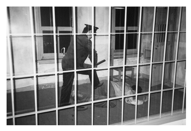
Figure 1 Scene from the 'Place of Experience'.

Two dominating effects are the 'blood' that covers the bodies and walls, and staged audio recordings of prisoners' screams and torturers' interrogations. Audio and motion effects are electronically activated when the visitor crosses hidden sensors. Brutality is not created only through the acts themselves. The facial expressions of the effigies of the Japanese officials, showing toughness, enjoyment or indifference, are a central contribution to this image. Furthermore, in an official booklet the curators describe the Japanese imperialists as employing 'methods of brutal torture intolerable to human beings' and explain that they ruthlessly tortured patriotic fighters on a regular basis. 'It was a standard practice' for them to 'drag both male and female Korean patriots and to beat them with a bat', while they also committed 'an inexpressible brutal method of sexual torture' (Sŏdaemun hyŏngmuso yŏksagwan n.d.: 28).