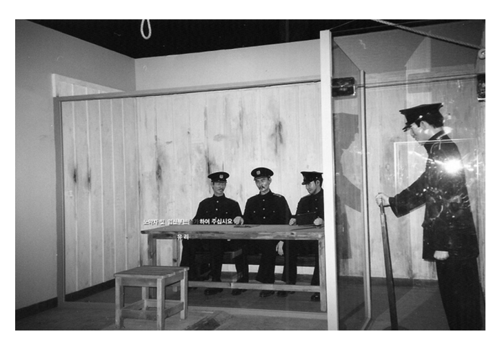
Figure 3 A reconstructed execution room scene.

diabolic colonizer presented in the exhibition hall, with the ordinary surroundings in which evil was inflicted, which creates the image of an extreme form of brutality and suffering that were perpetrated on and endured by man.<sup>6</sup> Recently, though, the curators of the site have made changes, which represent a phenomenon that Irwin-Zarecka termed 'an increasing commercial value of the past' (1994: 106).