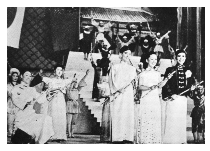
Figure 1 Peking finale. The finale of this 1942 production featured the 'Dance of the Five-Colour Flag,' which symbolized the unity of north and central China under Japan. From Takarazuka Kagekidan (1943: 15).

Similarly, the (Thai) director of the Thai Monopoly Bureau publicly declared about the play, Return to the East , that 'the stage sets, acting style, and choreography were redolent with the aura of Thai culture . . . I felt as though I had actually returned to my country' (Takarazuka Kagekidan 1943: 37).