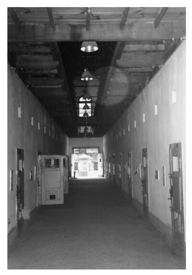
Figure 2 A look inside one of the preserved buildings.

The preserved Auschwitz concentration camp in Poland, and its function in the Jewish memory of the Holocaust, is similar in this regard to the Sŏdaemun Prison site and its place in remembering the colonial period in the ROK. The ordinariness, or the normality, of the preserved buildings convey the disturbing message of an un-mystified evil that originates from and is accepted by humans, an evil that is not an act of a certain 'demonic out-of-this-world' perpetrator. Thus, in Sŏdaemun Prison History Hall it is the tension created by the conjunction of the