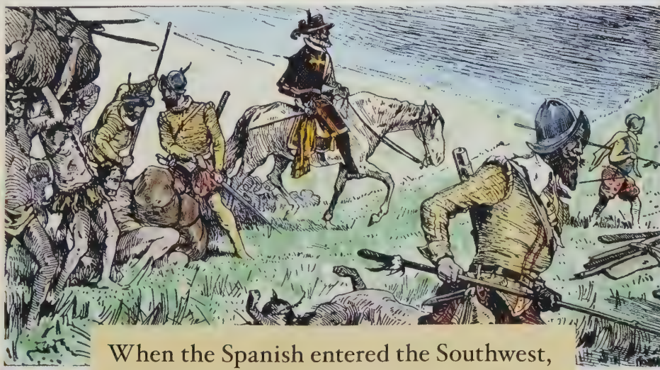
When the Spanish entered the Southwest, they forced the Indians to work for them.

Another huge change came when the Comanche Nation migrated south. Beginning in the early 1700s, they traveled from Wyoming to the southern Great Plains because they wanted to control the southern buffalo herds. Within a few decades, the Comanches drove the Plains Apaches from the area. In about 1724, the Comanches and Apaches fought a great battle on the Plains, which the Apaches lost. Most of the Plains Apaches were driven west, into the mountains of New Mexico. Only two Apache tribes were able to stay on the buffalo plains. The Lipan Apaches stayed south of the Comanches in Texas. The Kiowa-Apaches allied with the Kiowa tribe on the Great Plains.