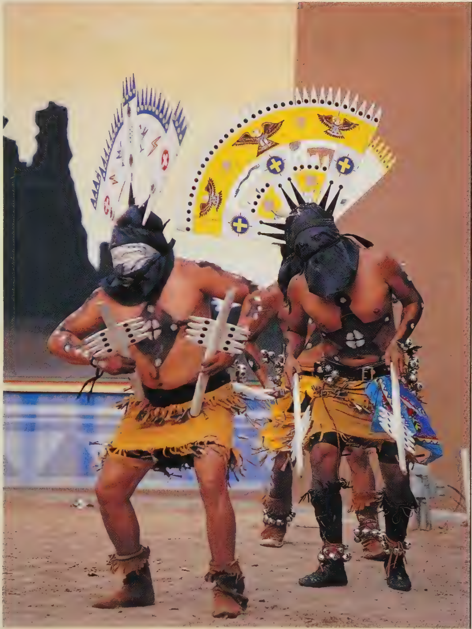
Apache dancers perform the Mountain Spirit Dance in Gallup, New Mexico.