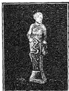
PRIAPUS AND SERPENT

This apparent contrast in the nature of the libido is strikingly illustrated by a Priapic statuette in the antique collection at Veiona 60 Priapus smilingly points with his finger to a snake biting off his "membrum." He carries