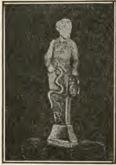
PRIAPUS AND SERPENT

This apparent contrast in the nature of the libido is strikingly illustrated by a Priapic statuette in the antique collection at Verona. 60 Priapus smilingly points with his finger to a snake biting off his "membrum." He carries