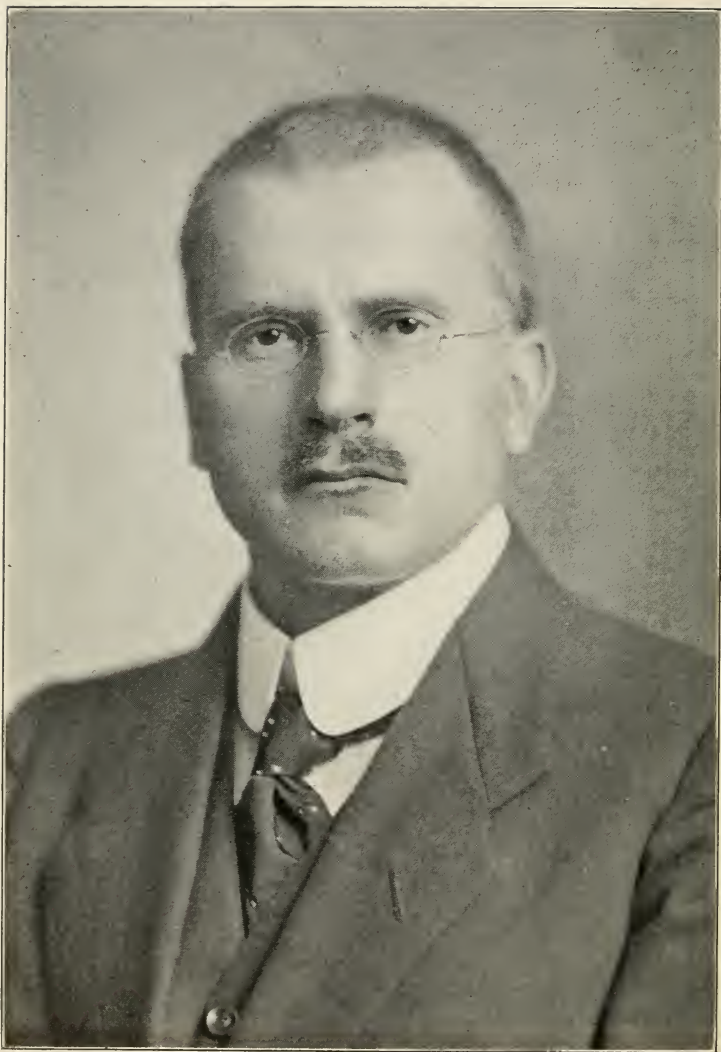
DR. C. G. JUNG "PSYCHOLOGY OF THE UNCONSCIOUS"