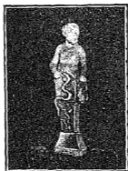
PRIAPUS AND SERPENT

This apparent contrast in the nature of the libido is strikingly illustrated by a Priapic statuette in the antique collection at Veiona 60 Priapus smilingly points with his finger to a snake biting off his "membrum." He carries