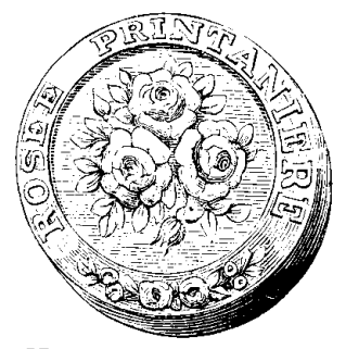
No. 141. $2.00 per doz.