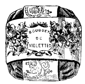
No. 77. $2.75 per doz.

We would call the attention of druggists and of dealers in Toilet articles to the following line of soaps, manufactured by L. Eeckelaers, of Brussels. We confidently recommend them as being UNRIVALED, both in QUALITY and PERFUME, by any soaps now offered, either of home or foreign manufacture. These soaps are not surpassed by any in the market as to quality and perfume, and are sold at reasonable prices. We annex fac similes of the most popular kinds.