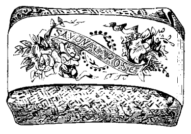
No. 156 (6 odors). $2.00 per doz.