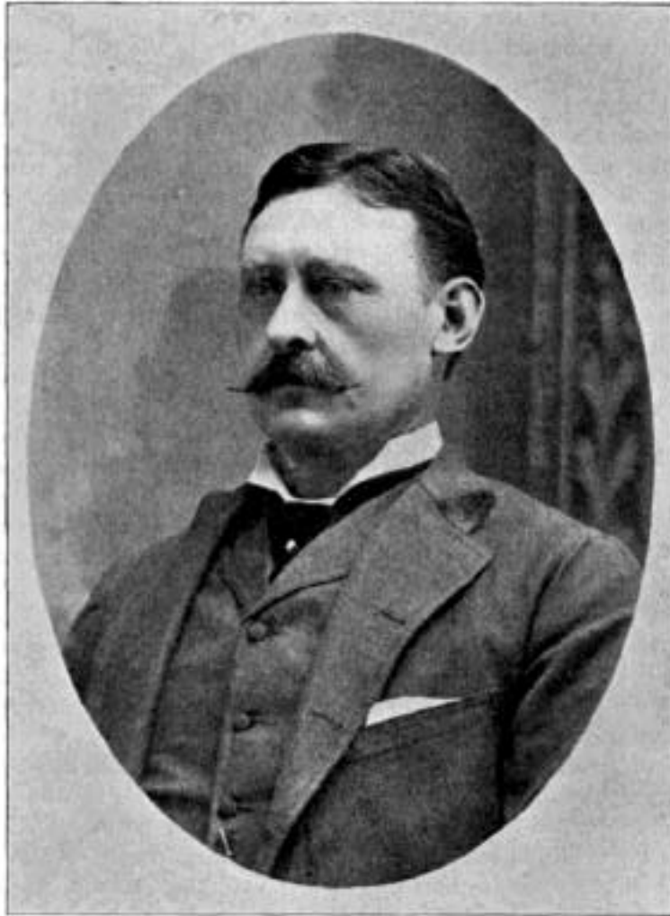
Sir Henry Arthur Blake, K. C. M. G., Governor of Jamaica.

In the statistics of this fertile island this article does not figure in pounds, shillings and pence as largely as do some of its other products. Economically speaking, however, ginger is one of its most important articles of commerce. In my judgment, from 25,000 to 50,000 of its people are more or less dependent upon the ginger crop for such ready money as is essential to maintain their existence. The cultivation and gathering of this drug is largely in the hands of that peculiar class of West Indian peasants known as Quashie. Quashie is the title given the snuff-colored and brown people as distinct from blacks, that make up nine-tenths of the inhabitants of the West Indies.