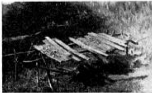
"Mat" for Drying Ginger.

Careful handlers put their ginger out as the sun rises, and turn it over at mid-day, taking it in at sundown. Rainy or cloudy weather invites mildew. It requires 6 to 8 days for the root to become thoroughly dry. I made several tests to ascertain the loss in weight by drying in the sun, and found the average to be nearly 70 per cent.