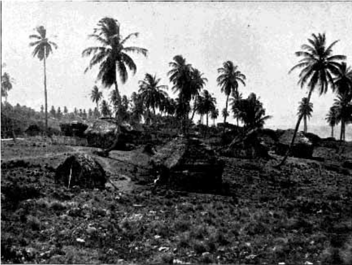
HOMES OF THE GINGER GROWERS.

with water, turns black, and emits an offensive odor. In this condition it is attacked by insects and worms, which has given rise to the belief among the planters that the rotting is caused by a so-called ginger worm. (It is possibly a fungus disease.)