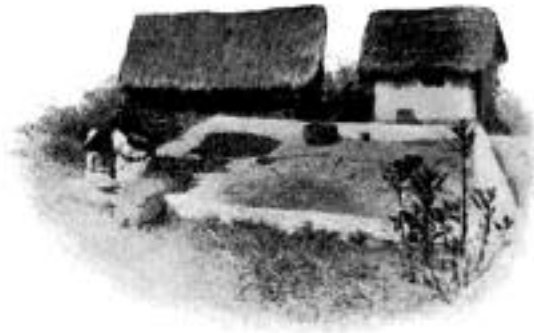
Barbecue used in Drying Ginger.

Careful handlers put their ginger out as the sun rises, and turn it over at mid-day, taking it in at sundown. Rainy or cloudy weather invites mildew. It requires 6 to 8 days for the root to become thoroughly dry. I made several tests to ascertain the loss in weight by drying in the sun, and found the average to be nearly 70 per cent.