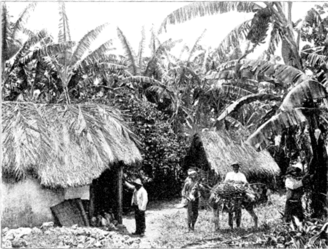
READY TO GO TO MARKET.

When the native tropical sun has fully dried the ginger crop, it is stored in heaps for market day. By unchangeable Ginger Land customs, there are certain days and times to carry products to market. There are banana days, pineapple days, pimento days and ginger days. The buyer must take in his supplies on these days or go without them.