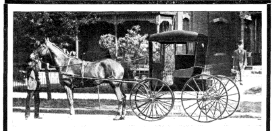
This is Cozy Cab No. 3315

Note the deep bed giving more than the usual amount of room under the seat and under the boot. A medicine case 10 1-2 inches high will go in either place. Plenty of space for surgical cases, blankets, etc.