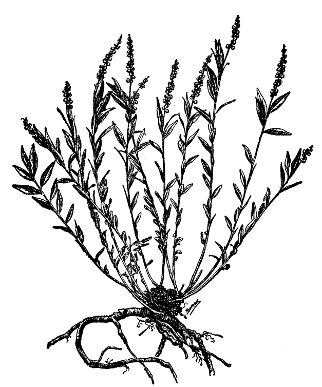
Seneca Snakeroot (Polygala Senega), Flowering Plant with Root.

HABITAT AND RANGE —Rocky woods and hillsides are the favorite haunts of this indigenous plant. It is found in such situations from New Brunswick and western New England to Minnesota and the Canadian Rocky Mountains, and South along the Allegheny Mountains to North Carolina and Missouri.