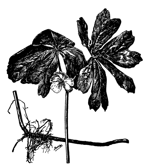
May-apple (Podophyllum Pellatum), Upper Portion of Plant with Flower and Rootstock.

DESCRIPTION OF PLANT —A patch of May-apple can be distinguished from afar, the smooth, dark-green foliage and close and