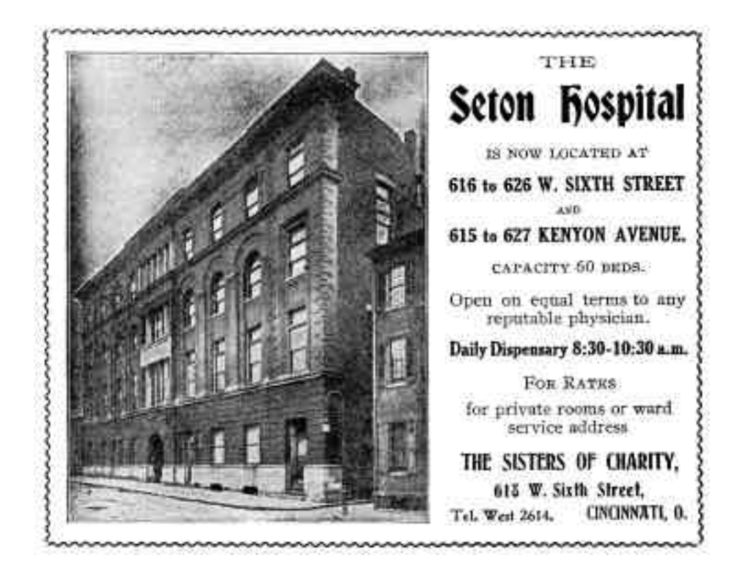
N.E.M.A. Quarterly, Vol. 7 #2 - Page 43 The Southwest School of Botanical Medicine http://www.swsbm.com

General Agents for Keleket Transformers, Bausch & Lomb and Spencer Microscopes, Faught and Tycos Sphygmomanometers.