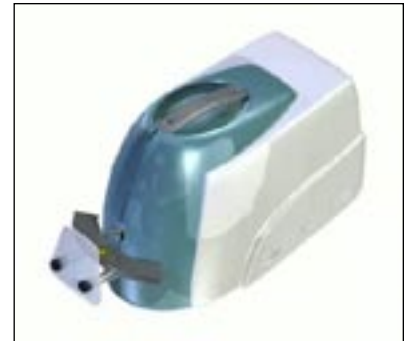
The Pharmanex® Nutrition Scanner For More information visit: http://www.newstarget.com/pharmanex-contacts.html

Other common questions about nutrition include: "What if I'm immuno-suppressed in other ways? Maybe I'm smoking cigarettes, or engaging in heavy physical exercise. Maybe I'm under heavy stress or not getting enough sleep or I'm exposed to environmental toxins through the air, the food or the water. How do I know whether the nutrition I'm taking is enough?" And until now, the answer has been that you don't know! It was very difficult to tell. You had to take a guess at how you felt, and that was a rather subjective way to determine if your nutrition was working.