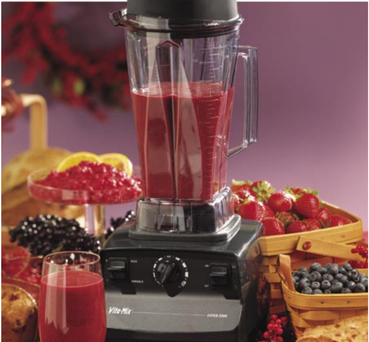
For more information about Vita-Mix high powered blenders, visit www.VitaMix.com .

Explore the recipes in the following pages, and have fun experimenting.