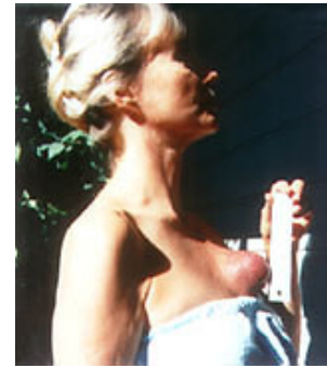
Tumor grew to the size of a grapefruit in less than 3 weeks!