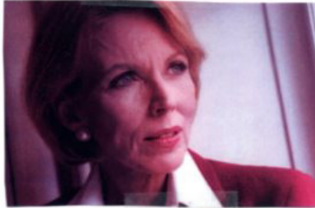
Bernadine Healy in 2001. Healy died Saturday at age 67.

Healy was a health commentator for CBS News and PBS-TV and columnist for U.S. News and World Report. She wrote or co-wrote more than 220 scholarly papers and authored two books, including a chronicle of her brain cancer, which first struck in 1996.