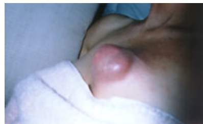
Notice that the tumor extends far deeper than the dark red top portion.