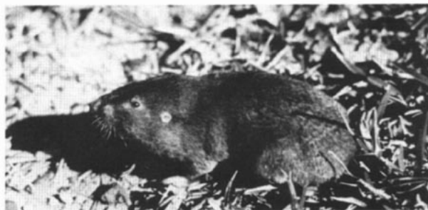
FIG. 1. Baird's pocket gopher, Geomys breviceps , from Harris County, Texas.

Although the condition and position of testes in males commonly is used to indicate breeding in mammals, there is no correlation between testes position in G. breviceps and the reproductive pattern in females or sperm production. Rather, testis size is a more reliable indicator of reproductive activity in males. Testes >11 mm long