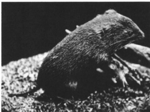
FIGURE 1. Photograph of mounted specimen of Microtus chrotorrhinus.

DISTRIBUTION. The geographic range of M. chrotorrhinus extends broadly across eastern Canada from Labrador and the Maritime Provinces to southwestern Ontario and adjacent northeastern Minnesota and constricts sharply southward through the Appalachian Mountains to North Carolina and Tennessee