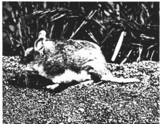
FIGURE 1. An adult Onychomys leucogaster , female, courtesy of Dr. Thomas P. O'Farrell. Photograph by Mr. Scotty Getchell, Battelle Laboratories.

Northern grasshopper mice have been trapped in the following habitats: short grass prairies of northeastern Colorado (Flake, 1973), semi-stabilized dunes of windblown sand in Utah (Egoscue, 1960), a sagebrush desert in west-central Nevada (O'Farrell, 1974), areas with sandy soil and little mulch in north-central Kansas (Kaufman and Fleharty, 1974), and short grass prairies, semi-stabilized dunes, and grasslands of Oklahoma (Ruffer, 1964). Egoscue (1960) suggested that O. leucogaster may require edaphic characteristics that allow for frequent dustbathing. This behavior aids in maintaining the pelage in a clean, non-oily condition.